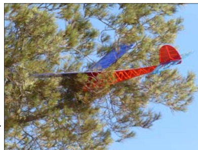
Right: Oops. Get details in October issue...