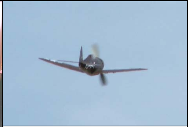
Is it full scale or is it a fine FAC model!

This was an excellent upscale meet, well-run and more than worthwhile for participants.