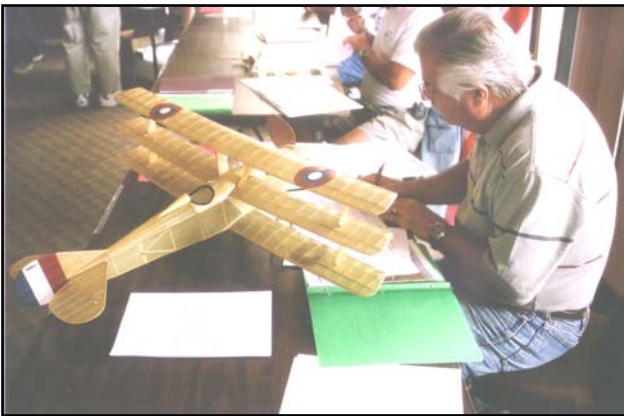
Judge does his thing with one of 96 scale models judged