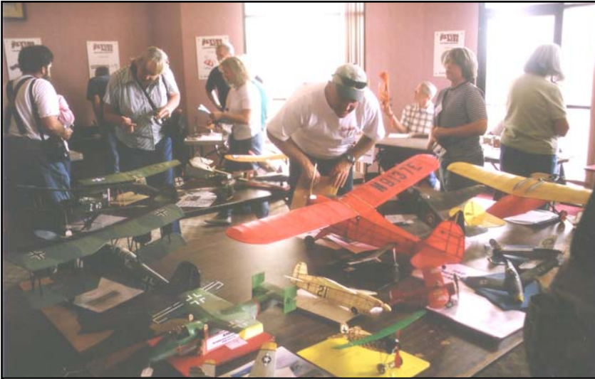
Just part of the many models waiting to be judged