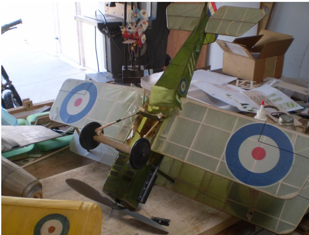
The Agony and Ecstasy of Free Flight!