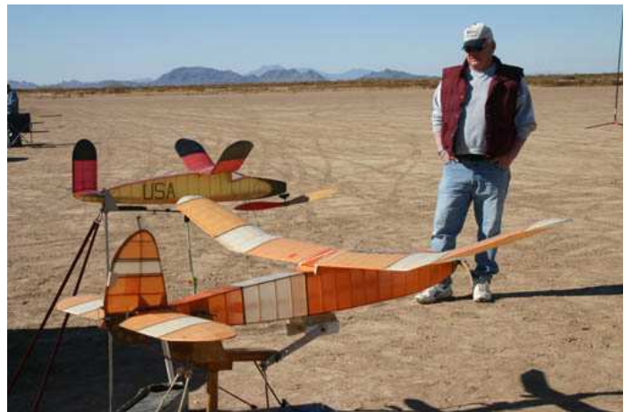
Lamb Climber, Front, Lanzo Classic Rear