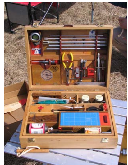
Doug's Box #2