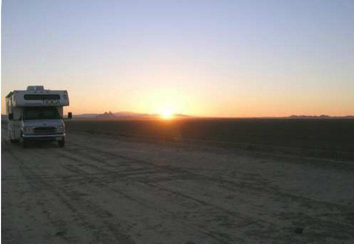
Sunrise at Eloy Arizona, Cold and Clear