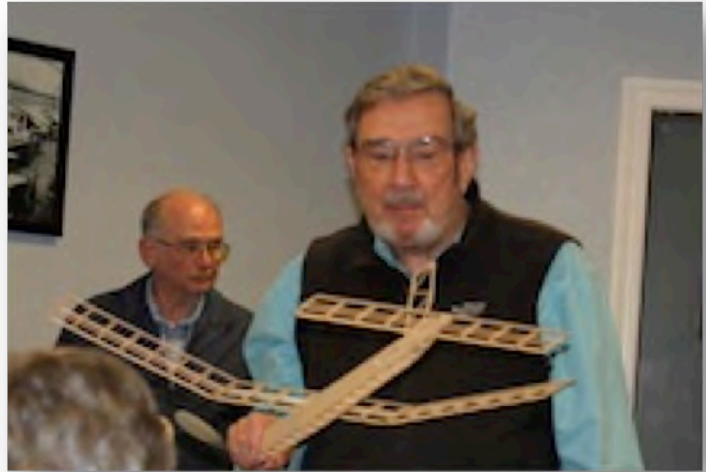
Tom's nice looking P-30 Square Eagle bones