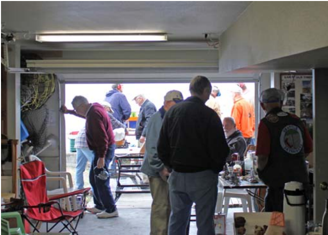
The view from within...to the sea! ...and the sea of activity!

Great weather, great group, great food (see Prez's report above!) and pics below! !