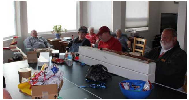
Auction results, with Greg T. looking smug!