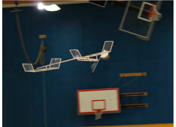
(Below) Bruce's A-6, on the wing, to another successful flight!