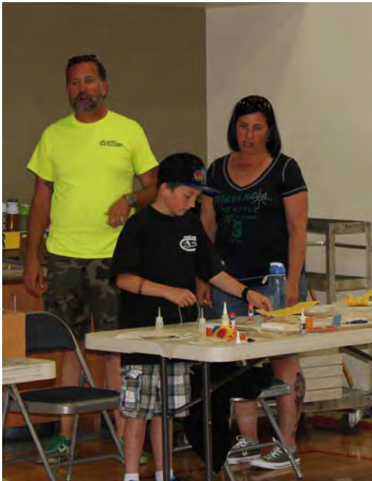
Dad, Mom and student (sorry, no name...) indulging in the fine art of model airplane construction!