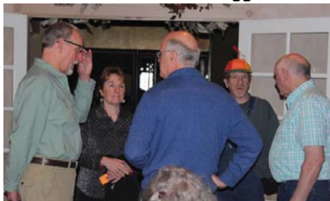
Pre Banquet chatter