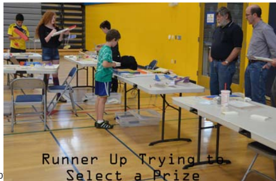
Runner Up Trying to Select a Prize