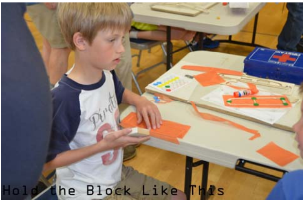
Hold the Block Like This