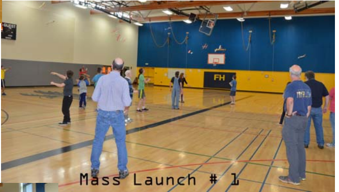
Mass Launch # 1