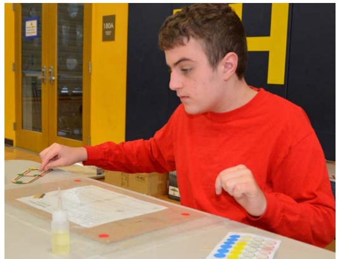
It kinda looks like this....