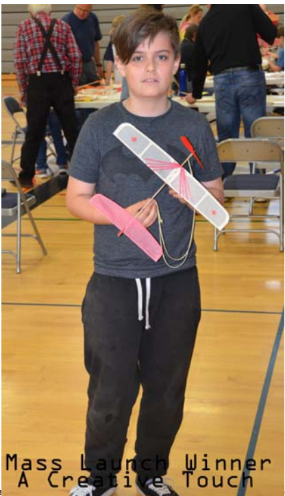
Mass Launch Winner A Creative Touch