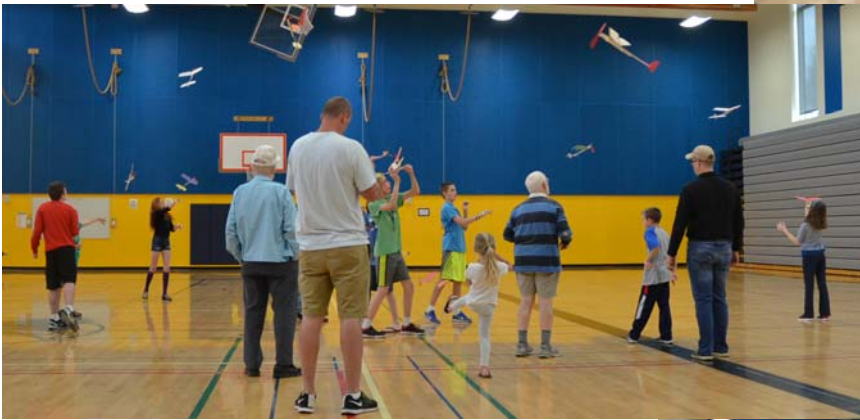
Mass Launch #2.....