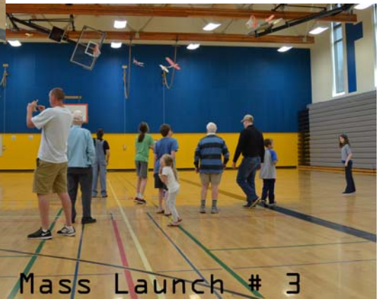
Mass Launch # 3