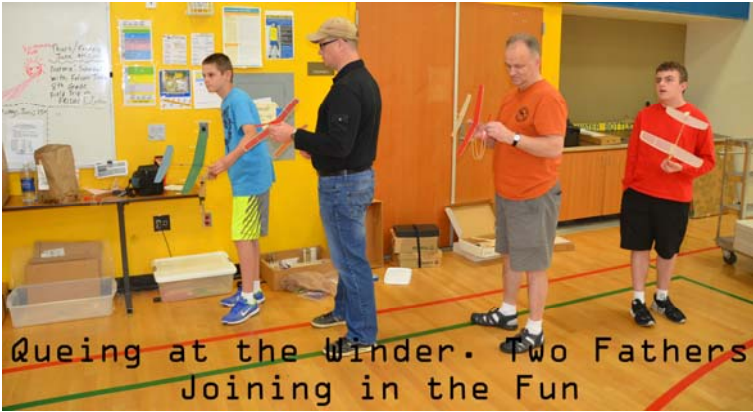
Queuing at the Winder. Two Fathers Joining in the Fun