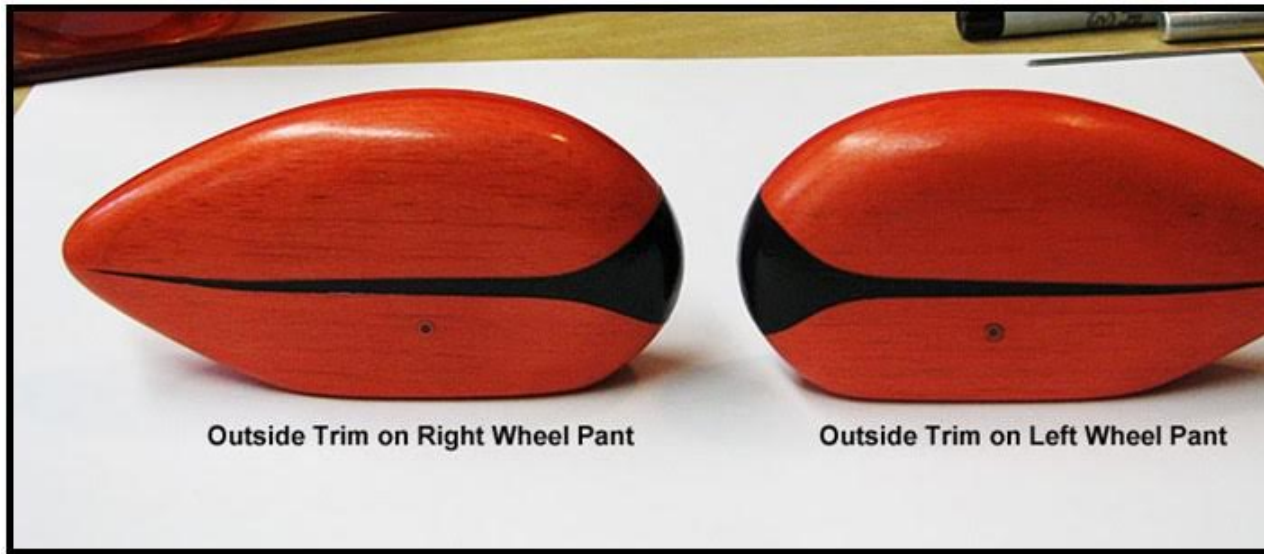
Outside Trim on Right Wheel Pant