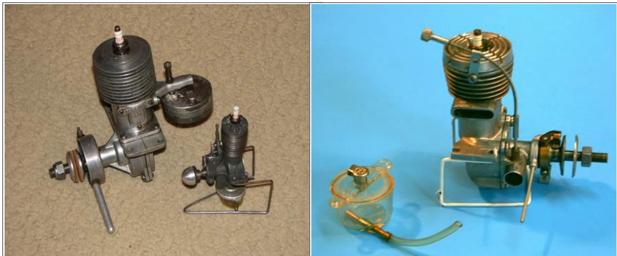
These three engines should be a little easier to identify than the previous four.

We've mentioned prop slippage before as a problem sometimes hard to detect or cure. It can result in a 'no start' or erratic running. It occurs often in big high torque engines, especially those with small drive washers, such as Forster 99's or Orwicks. But even Ardens can also have pesky prop slippage. And the Arden can easily spin the prop off, also tossing the 2 piece spinner screw off to get lost. A custom 1 piece spinner nut is a good investment for an Arden if you can make or find one.