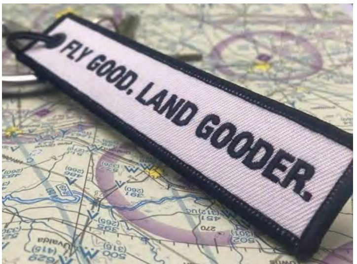
"Landing is importanter than flying"!