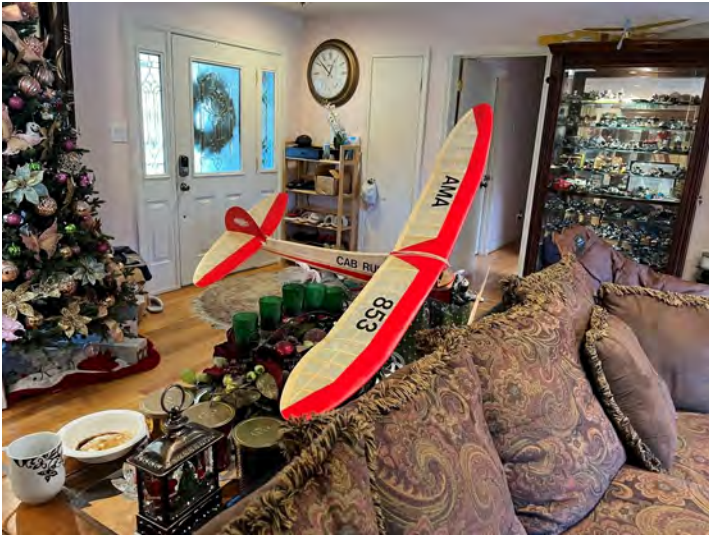
Another view of Bill's Cab Ruler.