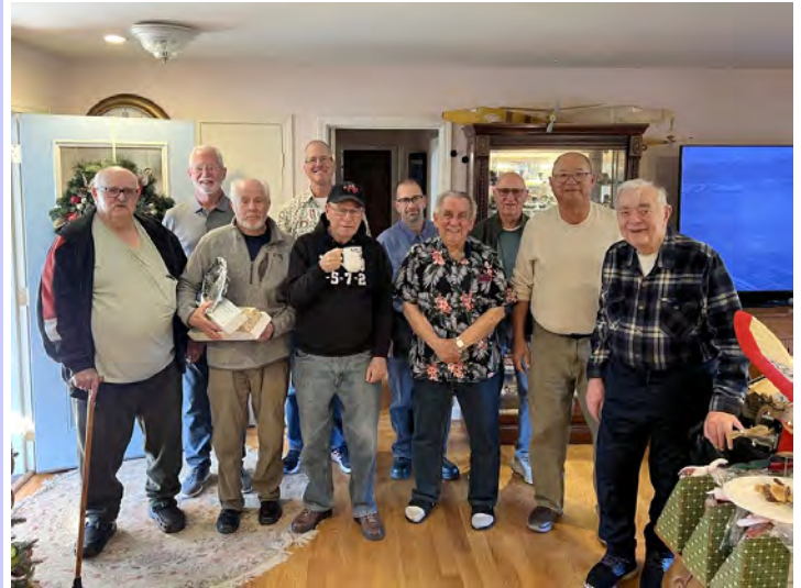
The mandatory group shot!