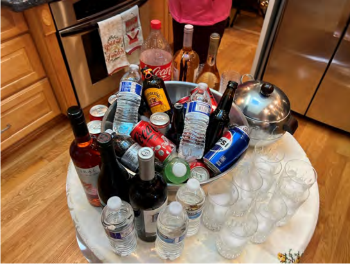
The "Watering Hole" or the "Thirst Station"!