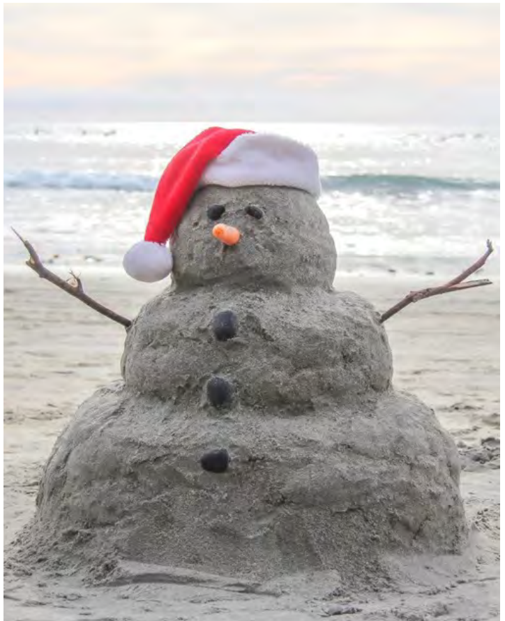
Snowman, California Style! (Sandman?)