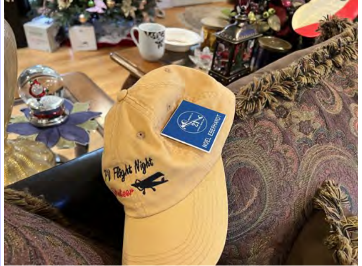
I'll give you three guesses who this belongs to!