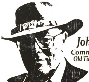
John Pond Commemorative Old Time RC Contest

I won \frac{1}{2} A Texaco at last summer's SAM Champs with the following Witch's Brew: