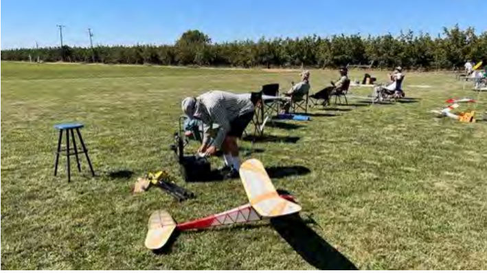
Some flight line actions. A Benny Boxcar up front.