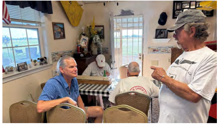
Award giving time!