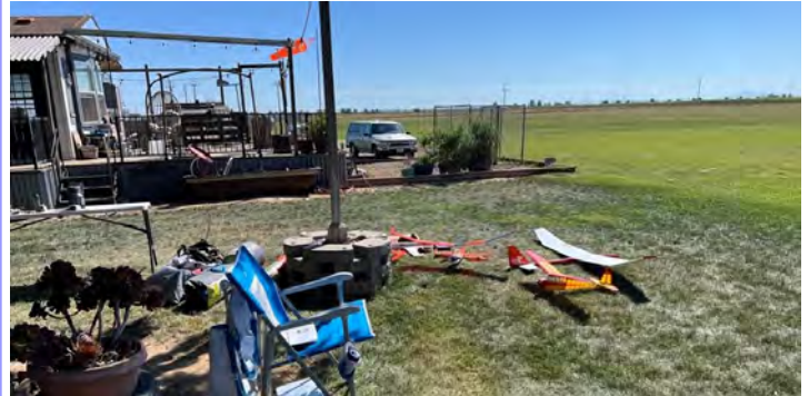
A collection of airplanes, they belongs to Jarron Wlodaver.