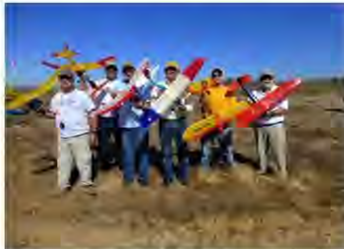
Half A Texaco flyers of SAM 27