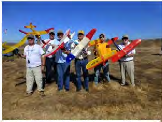
Some SAM 27 flyers and their planes.