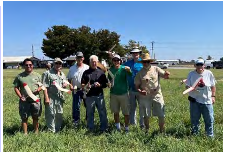
In the midst of the C&B, a slingshot glider event broke out. A few of the contestants joined in for the fun.