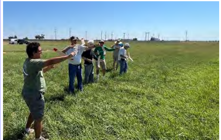
The mass launch. It resembles an organized chaos!