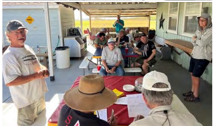
Till next year!