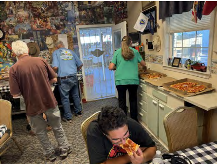
Friday night pizza event at the Ranch.