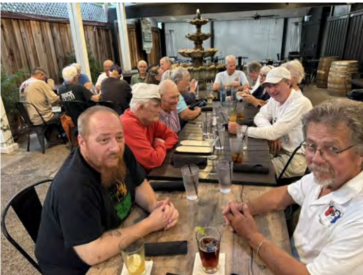
Saturday dinner was held at Freeport Bar & Grill. Someone has a birthday so we also have cakes!