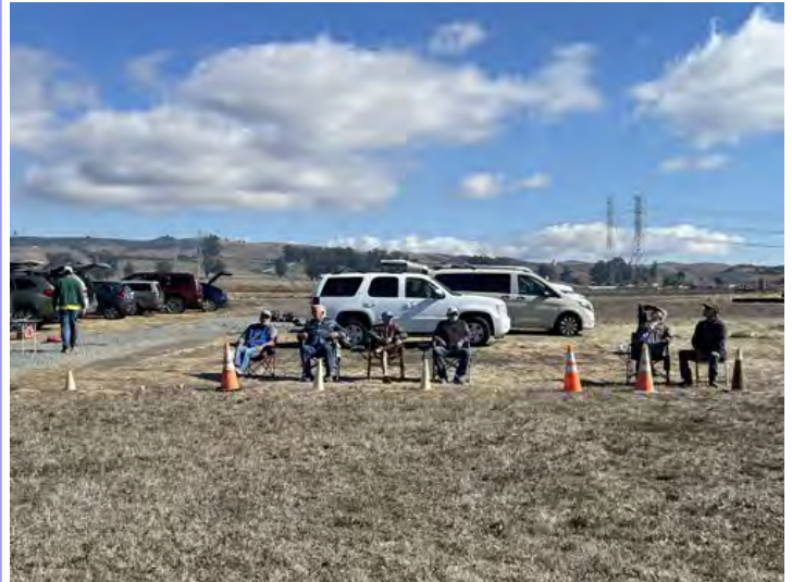
The usual TOFFF peanut gallery.