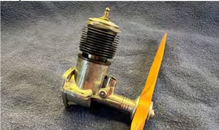
OK Cub .19