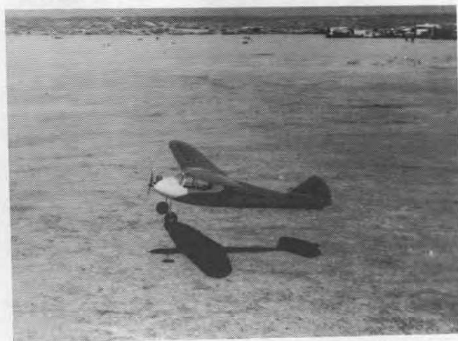
BOB OSLAN'S COMMODORE DOESN'T LOOK LIKE A HIGHLY COMPETITIVE OLD TIMER, YET IT ALMOST ALWAYS PLACES VERY HIGH IN TEXACO; THIS YEAR, BOB WAS 3RD. PLANS WERE RECENTLY PUBLISHED IN MODEL AVIATION .