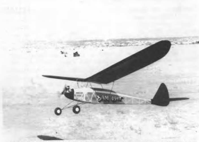
TOM KULP'S COLORFUL M-G WAS THE ONLY ONE ENTERED IN THURSDAY'S TEXACO EVENT. WING AND TAIL ARE BLACK ON THE BOTTOM FOR EXCELLENT VISIBILITY AT HIGH ALTITUDES.