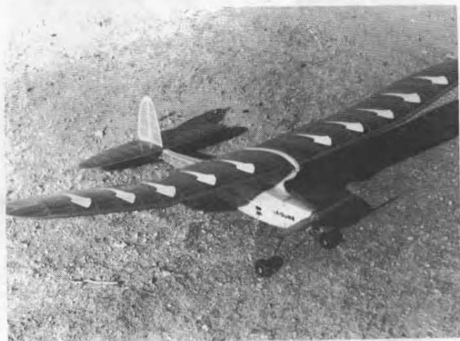
ROLAND BOUCHER'S 67-INCH PLAYBOY IS POWERED BY ONE OF HIS NEW POWER SYSTEMS BASED ON AN ELECTRIC CAR MOTOR. HAD ONLY ONE SHORT TEST FLIGHT BEFORE ENTERING THE CONTEST.