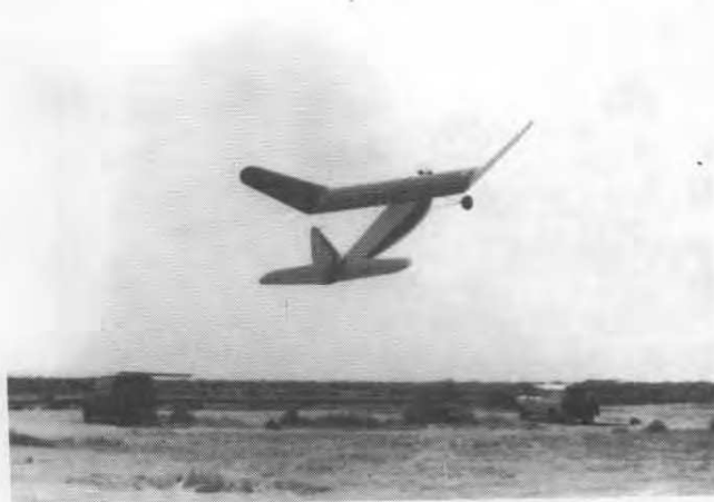
CHARLIE CRITCH'S BEAUTIFULLY BUILT EHLING ON ITS WAY TO A FIRST PLACE WIN IN CLASS C. K&B 5.8 GIVES THE MODEL A FRIGHTENING RATE OF CLIMB.