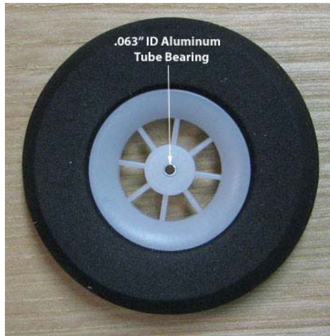
This picture shows a close up of the wheels mounted on the landing gear.