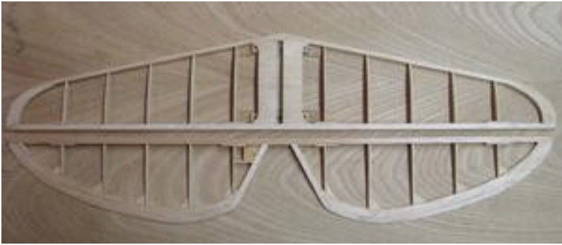
Stripped, Re-glued, and refinished Horizontal Tail