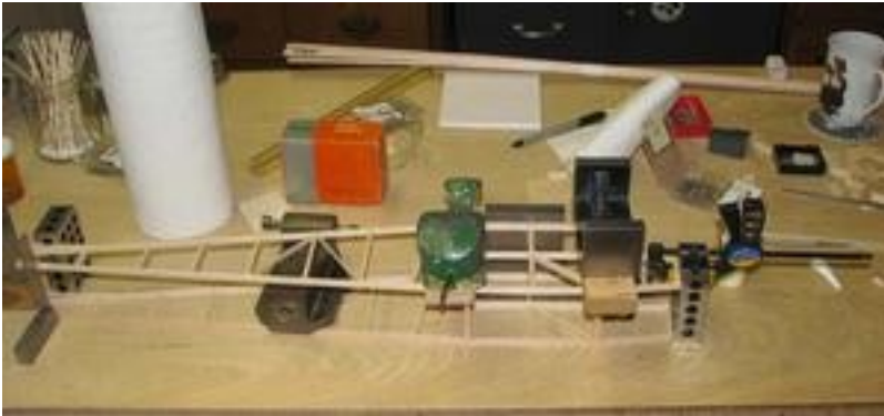
Jigging for Assembling New Fuselage Sides

At 75 years of age, I am not one to give up or get discouraged easily. The Speed 400 event is one that interests me very much. I think the Cleveland Cloudster with the polyhedral wing is going to be strong competitor in this event. The recovered Cloudster is pretty well trashed out, but there are some tail components that are use-able. Since I still have time before the 2010 SAM Champs in September, I have started construction on a second Cloudster. I am not writing detailed construction reports on this rebuild because it would be redundant with the first series, but I will share a few pictures with you on where I am at the present time.