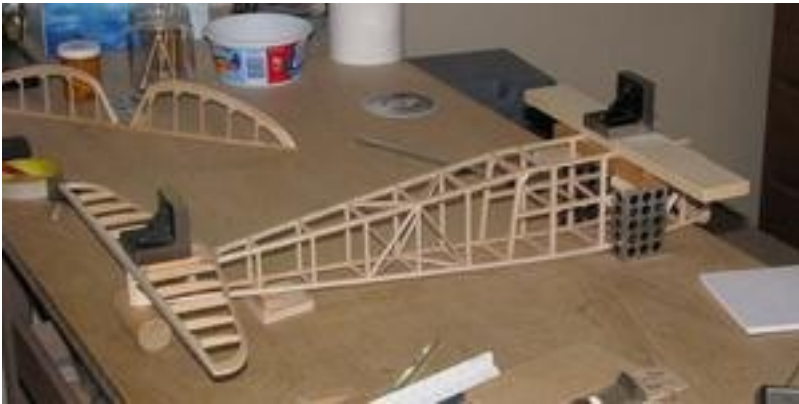
Jigging for Stab Mounting Platform