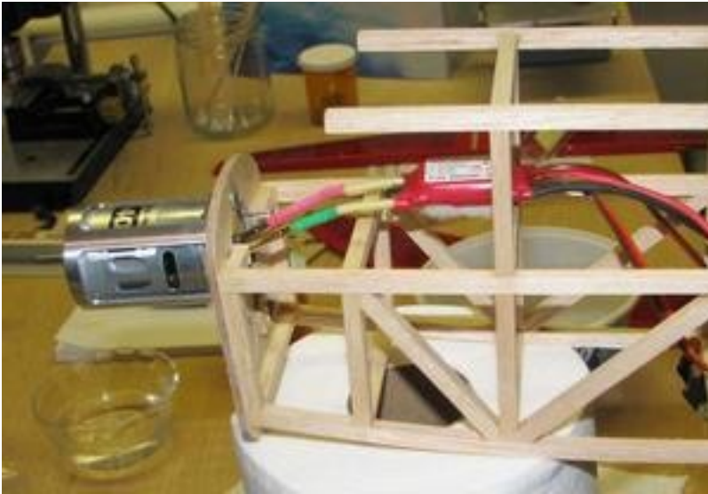
New Aluminum Motor Mount