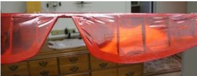
Recovered Stressed Elevator and Stab

The vertical tail covering was water stained and I cleaned that all off with a glass cleaner and soft rag. I discovered that the tip of the fin had received a moderate blow to the top edge as shown below, which left the silk covering on one side of the tip wood a little wrinkled. I injected distilled water into the crushed balsa through the covering with the syringe that has a "hair" size needle also shown below. Then I applied a little heat to the area, which expanded the damp balsa underneath and tightened up the silk covering. This completely repaired the damaged tip so you can not tell it was ever damaged!