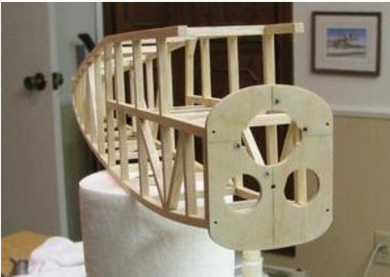
New Fuselage Primary Structure