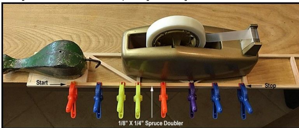
Both sides are now ready for assembly.....Tandy

This picture shows the 1/8" X 1/4" spruce doubler clamped and glued on the top left longeron's inside face. The fuselage frame was weighted down on the work table to keep it straight while the glue dried.