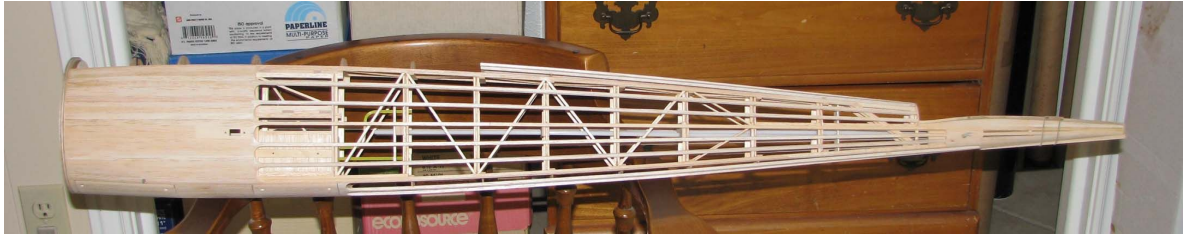
This picture shows a close up of the twelve stringer fillets where the stringers attach to the forward planking.

This afternoon I finished the forward "barrel" planking with strips of 3/32" X 1/4" balsa on the left side of the fuselage and added the two additional side 1/8" square stringers, including the six additional stringer fillets as shown below. I'll be a little larger so you could see more detail on the left side of the fuselage. Notice I have removed the sub rudder and inserted a piece of 3/16" X 1/4" balsa strip just to protect the slot from getting dinged. The strip is held in place with a rubber band.