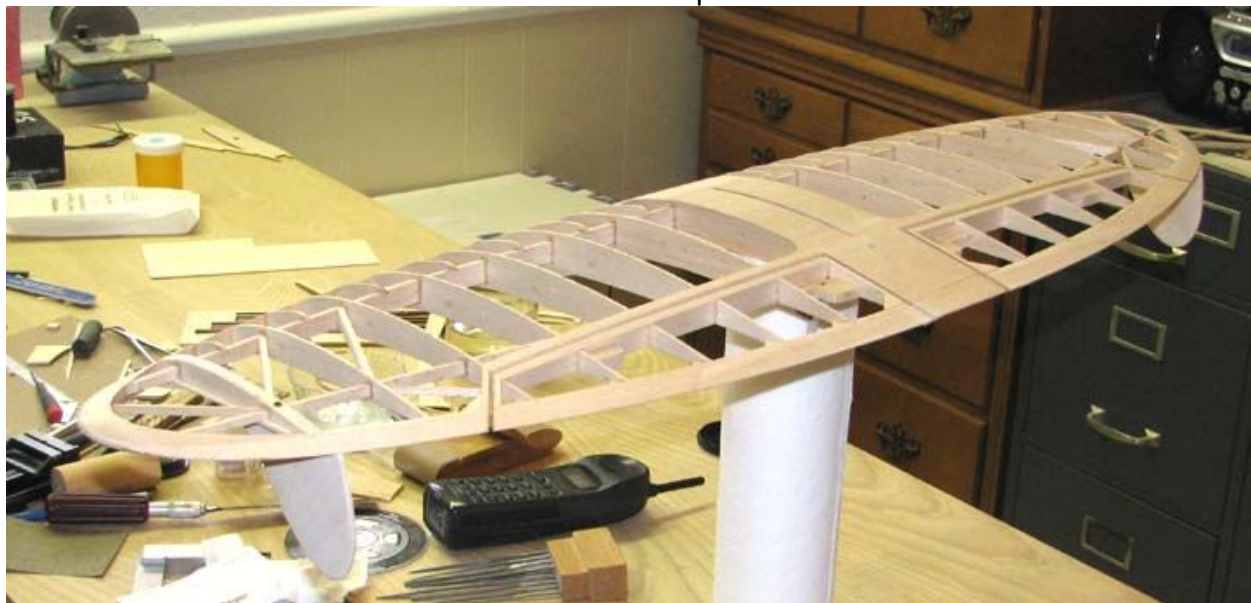
View looking up from the bottom.