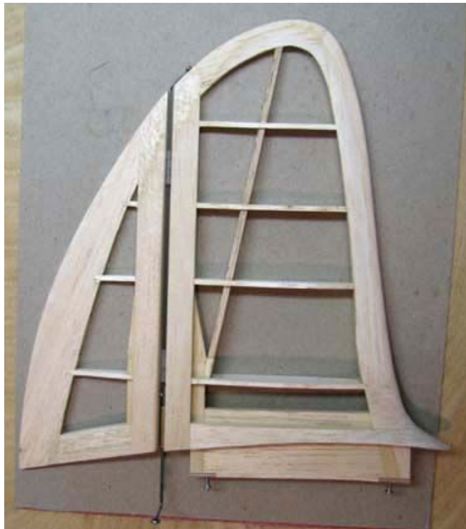
This is a close up of the hinge wire retention screw.