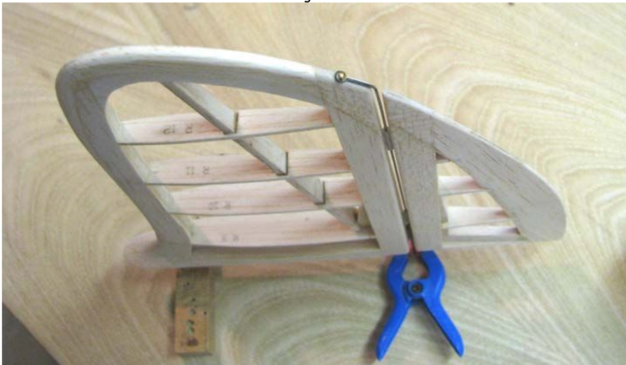
This picture shows the planform view of the vertical tail

Once the epoxy had cured, the continuous hinge wire was inserted down through the hinge halves, which coupled the rudder to fin as shown below. The final step of course was to screw in the 0-80 X 1/4" brass screw onto the threaded boss to retain the hinge wire.