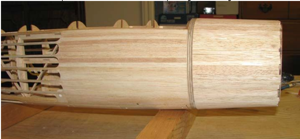
Once the barrel planking had thoroughly dried, I removed the cowl from the fuselage and took this picture from the rear of the cowl.