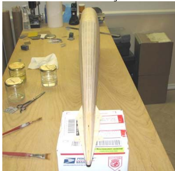
Two Hatches on the Bottom