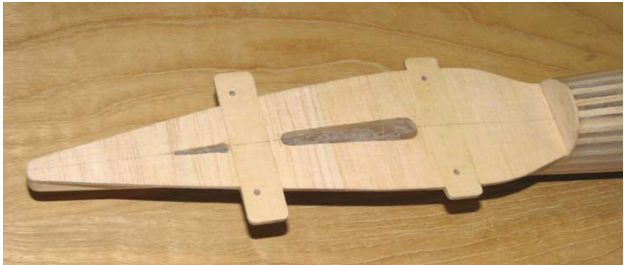
Bottom of Stab Platform