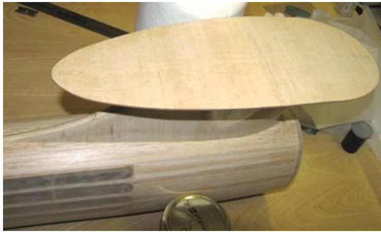
Top Stringer Fillets