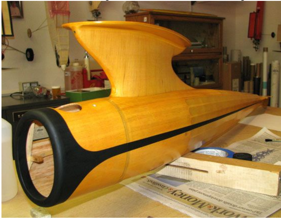
This is an aft looking view of the right side of the fuselage. Unfortunately, the exhaust cut out in the cowl extends into the black trim slightly, but it couldn't be avoided.