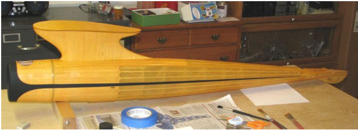
This is my favorite forward looking view of the Sailplane's complete fuselage.