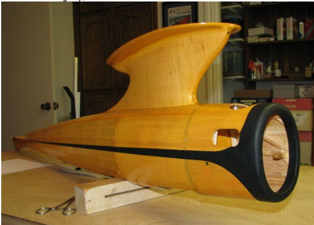
This is a left side view of the fuselage.