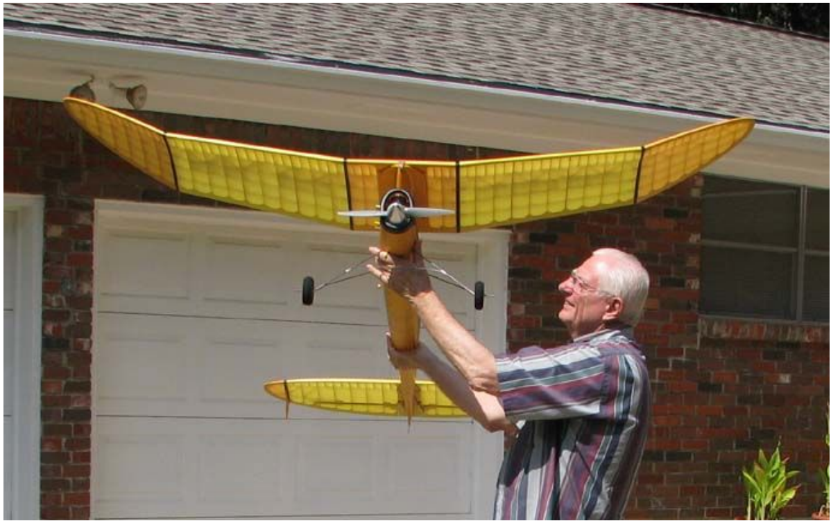
View from the Top