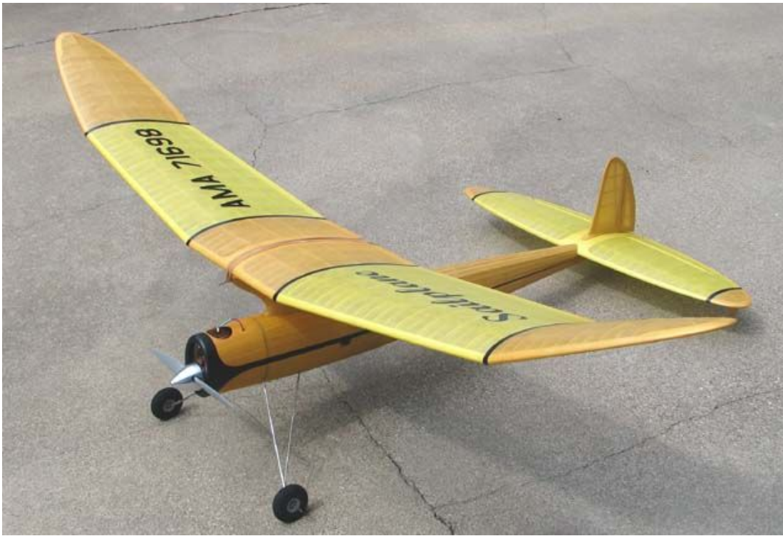
View from the Side (My favorite picture of the Sailplane)